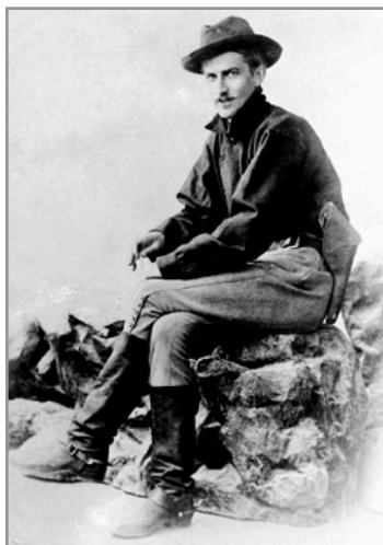
Stephen Crane poses in Greece during the Greco-Turkish War in 1897.

SPEAK'S LETTERPRESS is proud to announce the forthcoming limited-edition book titled Selected Lines of Stephen Crane . This will be the first publication from the Press. The edition will be printed by letterpress using handset type on a turn of the century antique press.